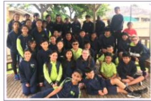
Farewell Year 6s! We will miss you!

Students have identified and explored a variety of angles including internal and external. They enjoyed finding these angles on pictures of a cake and a dog made out of shapes and angles. While all of this was going on, students continually reflected on their skills to ensure they could explain their mathematical thinking.