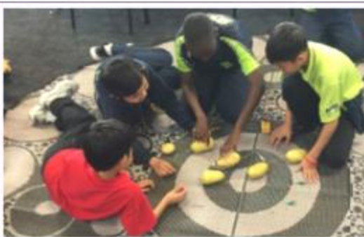
Year 6s making potato circuits