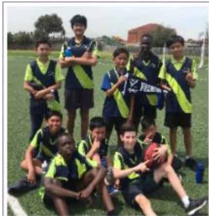
Mixed Basketball District winners