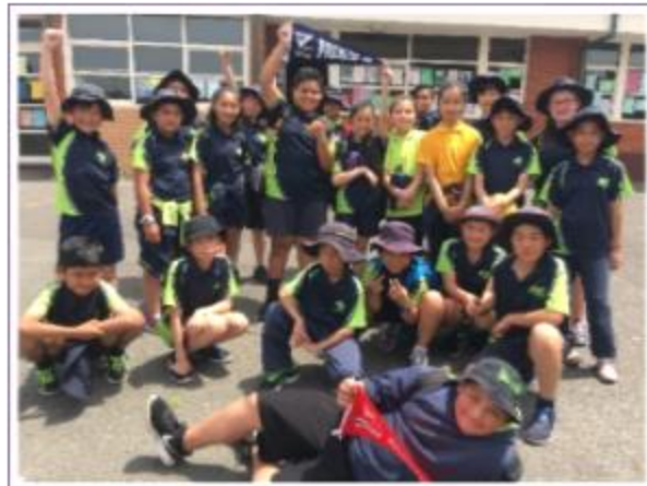
Volleystars A and B teams after playing in the District finals!