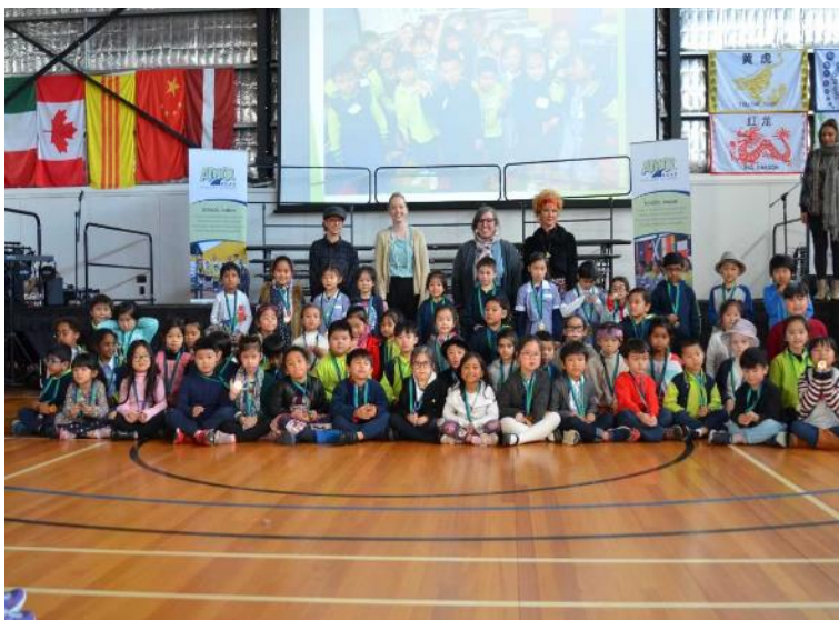
The Foundation students were very excited to receive medals to celebrate their 100 days of school.