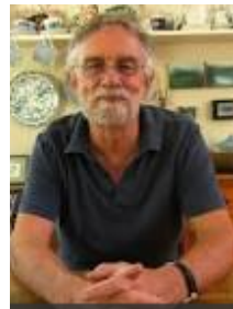
Author Bob Graham

Texts that students will be studying include Vanilla Ice Cream , Let's Get a Pup and A Bus Called Heaven